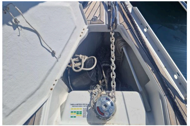
Anchor chain compartment on a 2002 Grand Soleil 43 sailboat deck.