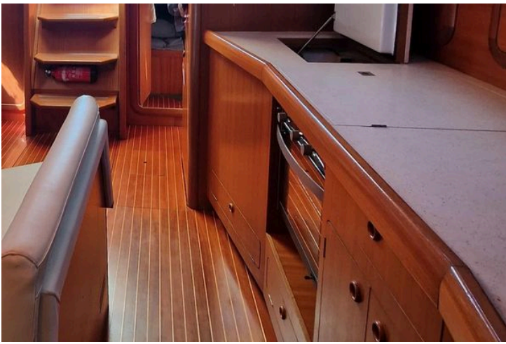
Interior of 2002 Grand Soleil 43 yacht with wooden cabinetry and seating.