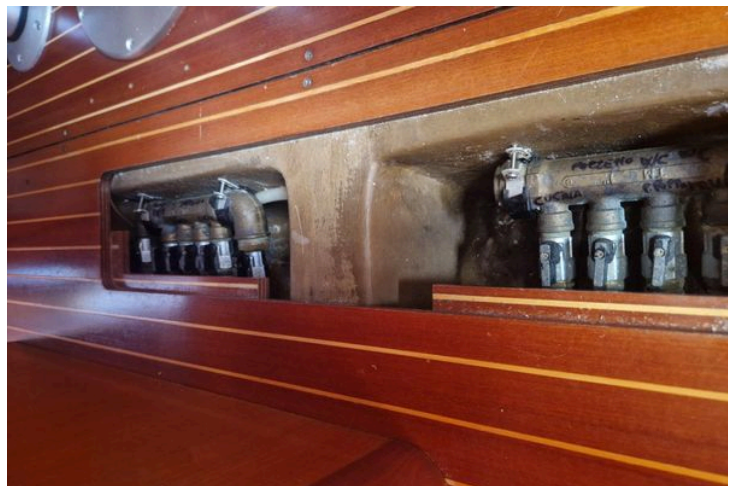
Interior view of a 2002 Grand Soleil 43 yacht's wooden paneling and plumbing system.