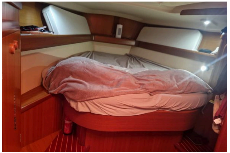
Cozy cabin interior of 2002 Grand Soleil 43 sailboat with wooden finish and bedding.