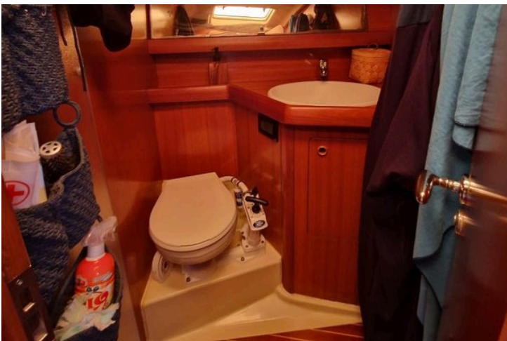
Grand Soleil 43 yacht bathroom with wooden cabinetry, toilet, and sink, 2002 model.