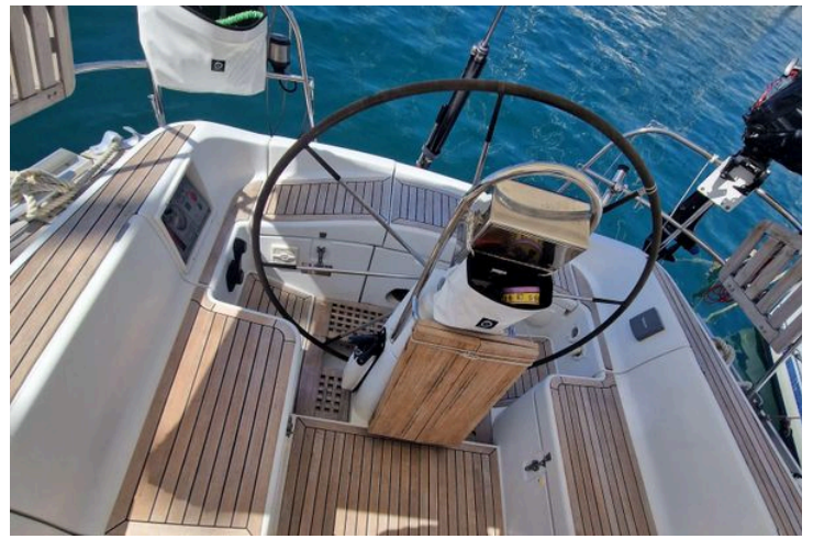
Cockpit of 2002 Grand Soleil 43 sailboat with wooden deck and steering wheel.