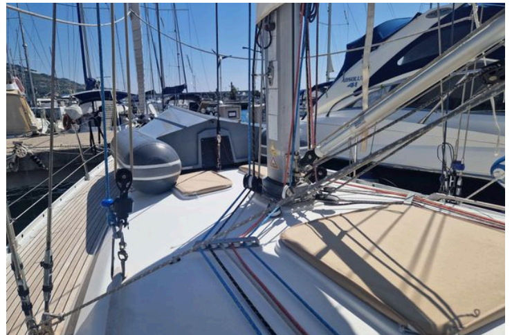
Grand Soleil 43 sailboat deck, 2002 model, docked at marina with clear blue sky.