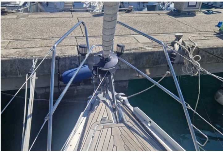
Bow of 2002 Grand Soleil 43 yacht docked at marina.