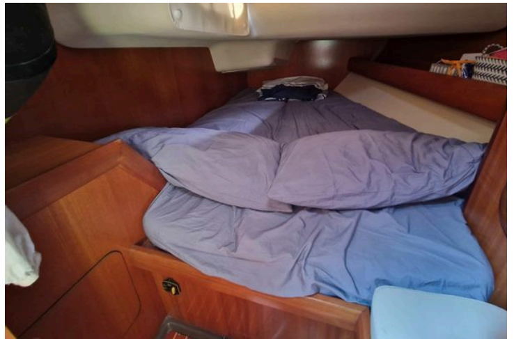
Cozy cabin interior of 2002 Grand Soleil 43 sailboat with blue bedding.