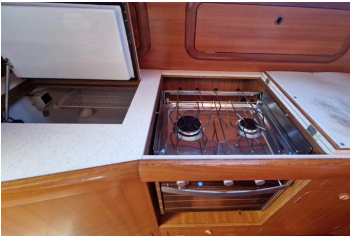
Kitchen area of 2002 Grand Soleil 43 yacht with stove and storage.