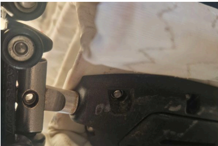
Close-up of a mechanical component on a 2002 Grand Soleil 43 sailboat.