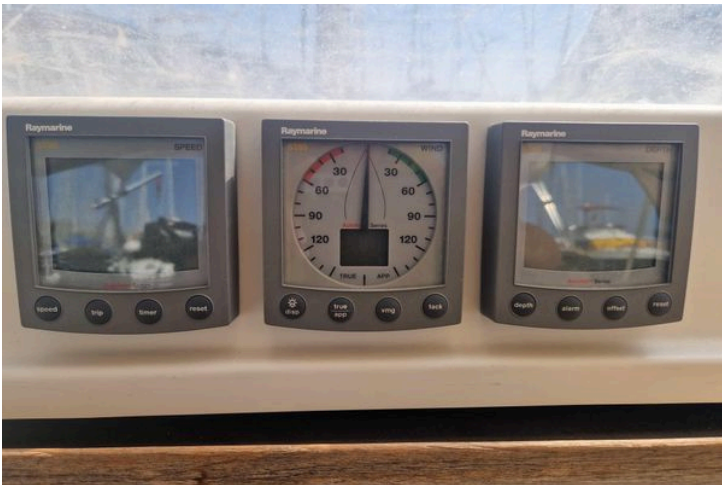
Raymarine navigation instruments on a 2002 Grand Soleil 43 yacht dashboard.