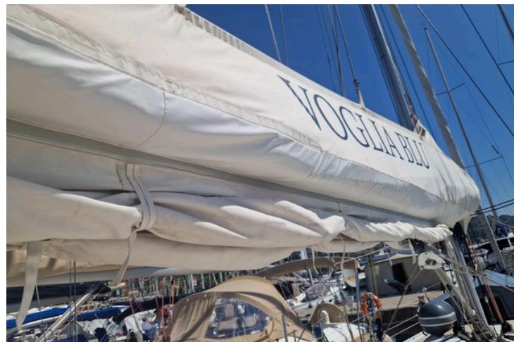
Grand Soleil 43 sailboat, 2002 model, docked with sails furled, clear blue sky background.